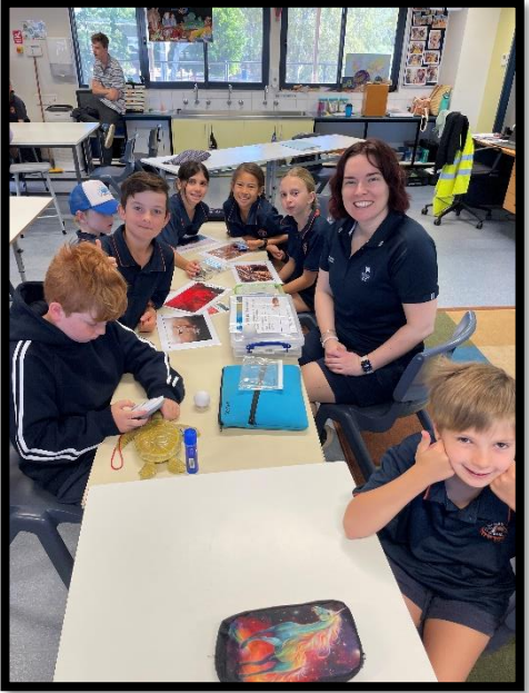
Science Week 5