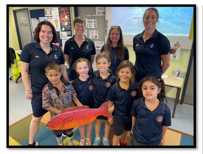
Dates to Remember Friday 23 August – Primary Tri Schools Monday 26 August – P&C Meeting Monday 9 ~ Friday 13 September – Year 5/6 Camp Wednesday 11 September – Room 2 Assembly Thursday 12 September – R U OK? Day Tuesday 17 September – Year 12 Graduation Dinner Friday 20 September – Last Day of Term 3

Onslow School's Bullying Roadmap can be viewed on our website. https://www.onslowschool.wa.edu.au/parent-info/policies/